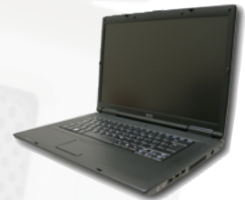
X Class 15.4"

Just compare WyseStore.com prices with our competitors.