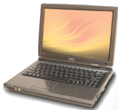
X Class 12.1"

Our Authorized Recertified Wintarms are in "like new" condition. They have no major cosmetic defects and have no signs of wear & tear, and are backed by our one-year limited warranty. In most cases, these terminals have never been used!